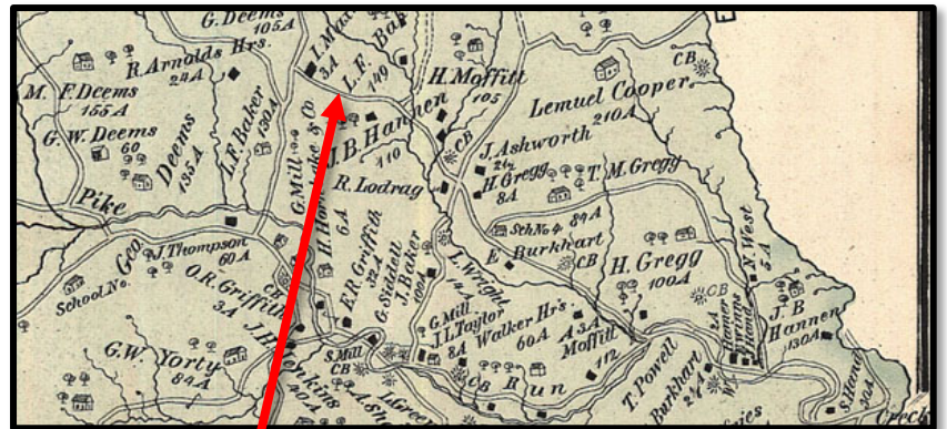
L. F. Baker owned a farm in West Pike Township and can be seen on the township map.